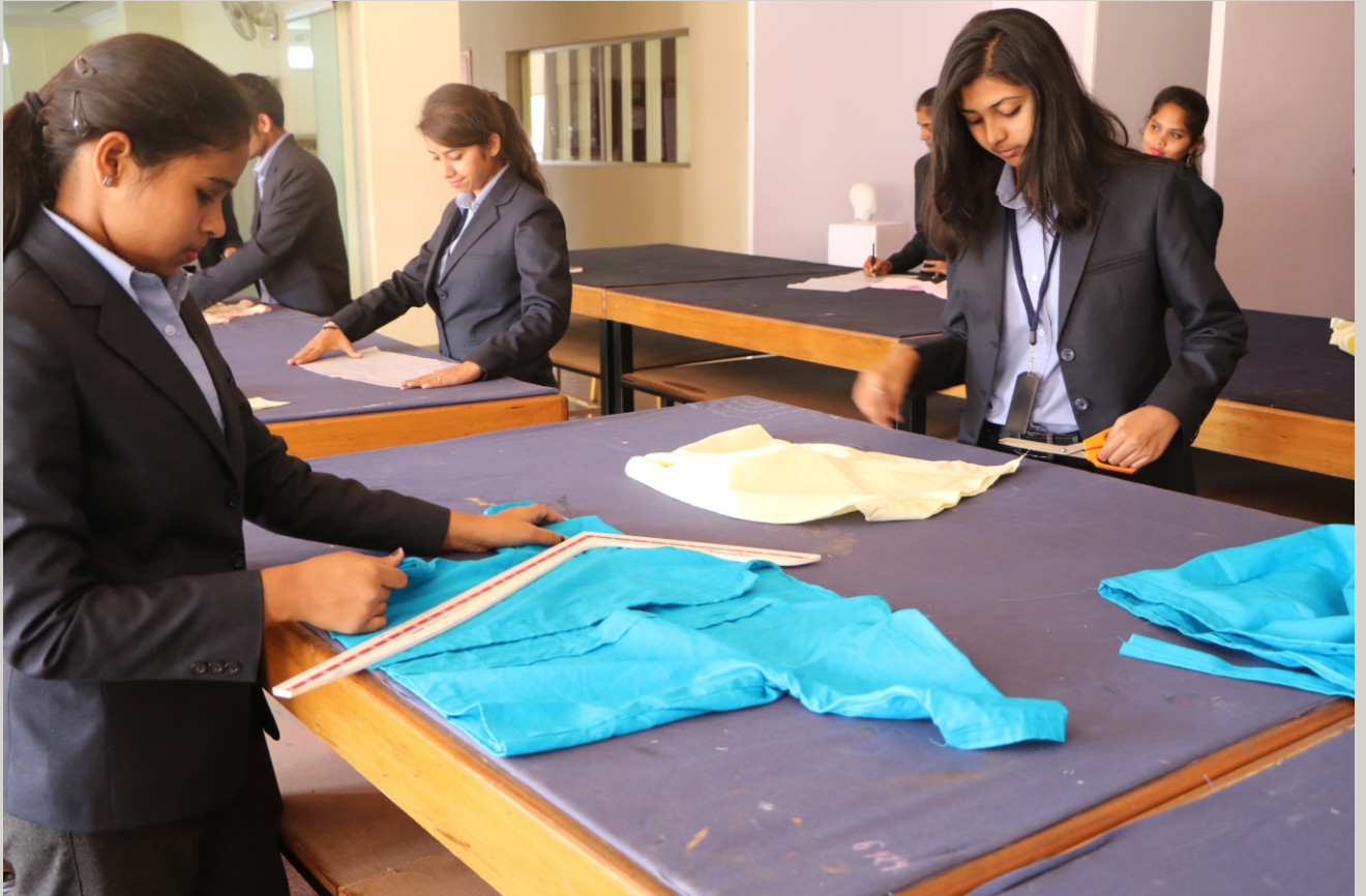
Patternmaking Lab (Ground Floor)