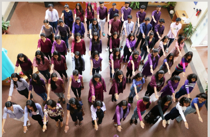
Batch of 2019-22 taking the AIFD Pledge