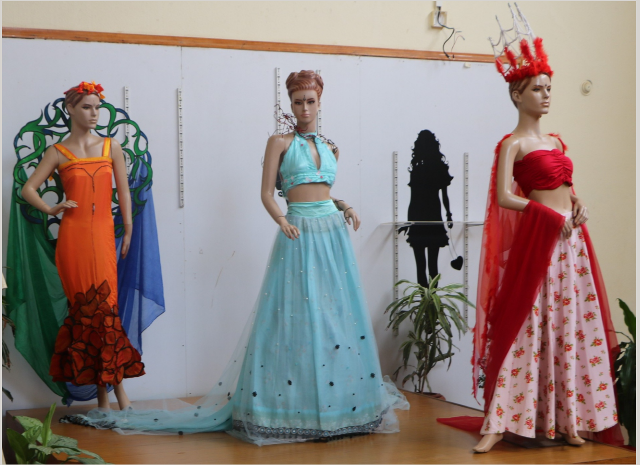
"Panchabhutha" Collection in lobby

AIFD is not just yet another Fashion Institute in the country. The Institute is well established with several distinguished leaders in the Fashion, Textile and Design industry. It has first and foremost, the invaluable support and backing of AWES.