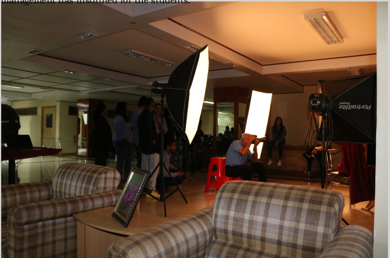
Photography Workshop in progress at professional studio

With Fashion Photography becoming an integral part of the fashion curriculum, being required for Fashion Styling, and e-commerce, the Institute has set up a state of the art Photography lab, with the latest equipment and cameras. Students are encouraged to use the equipment for individual assignments, thus making them explore their creative and business side. The VM and Photography Lab are additional infrastructure that the management has instituted for the students.