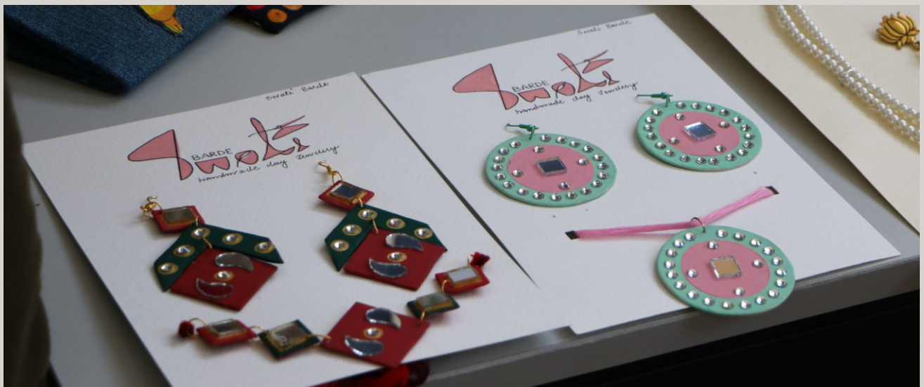
Collection of Fashion Accessories by Swati Barde

All court cases and legal matters if any will be dealt within the jurisdiction of Bangalore only.