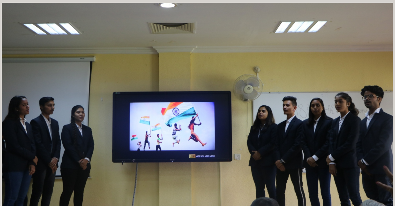
Celebrating the life of President-Scientist Dr APJ Abdul Kalam

AIFD also offers a two year M.Sc degree in Fashion & Apparel Design affiliated to Bangalore North University.