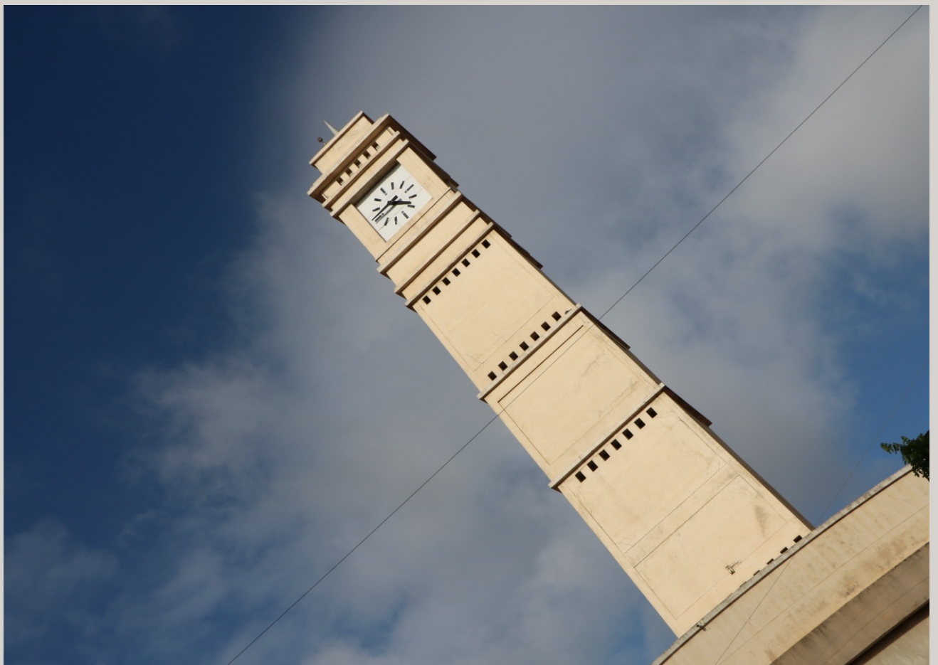
The AWES Clock Tower