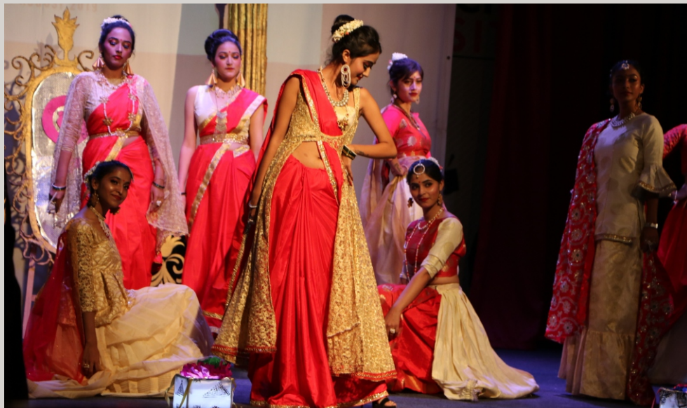
Prize winning moments at Inter-collegiate Fashion Show