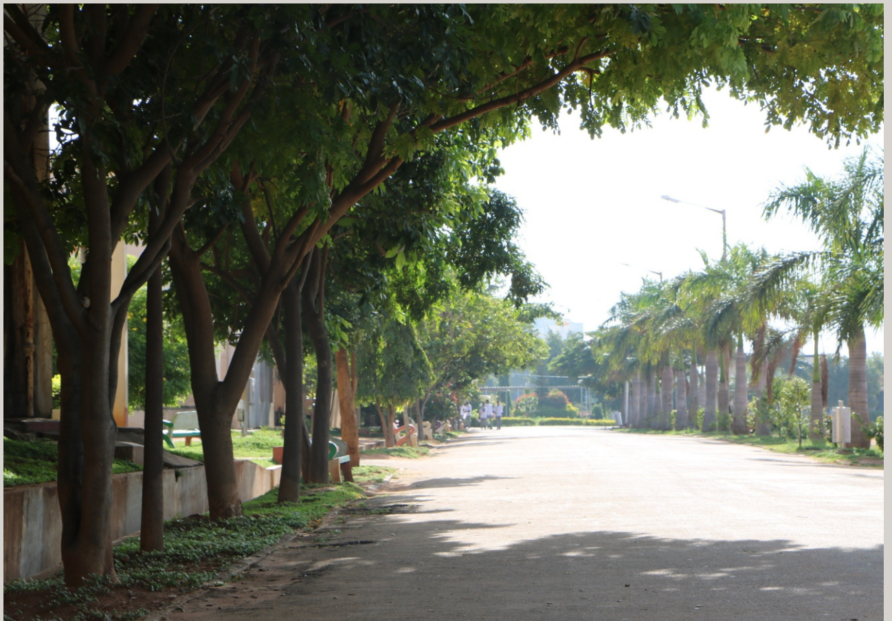
The serene AWES Campus in the morning light