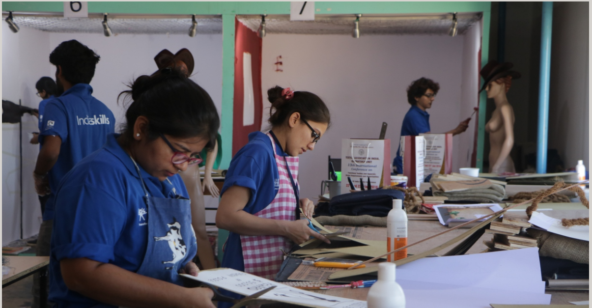
India Skills Competition in Progress in AIFD Lab