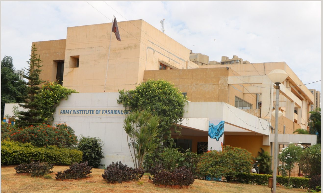
Army Institute of Fashion & Design Building