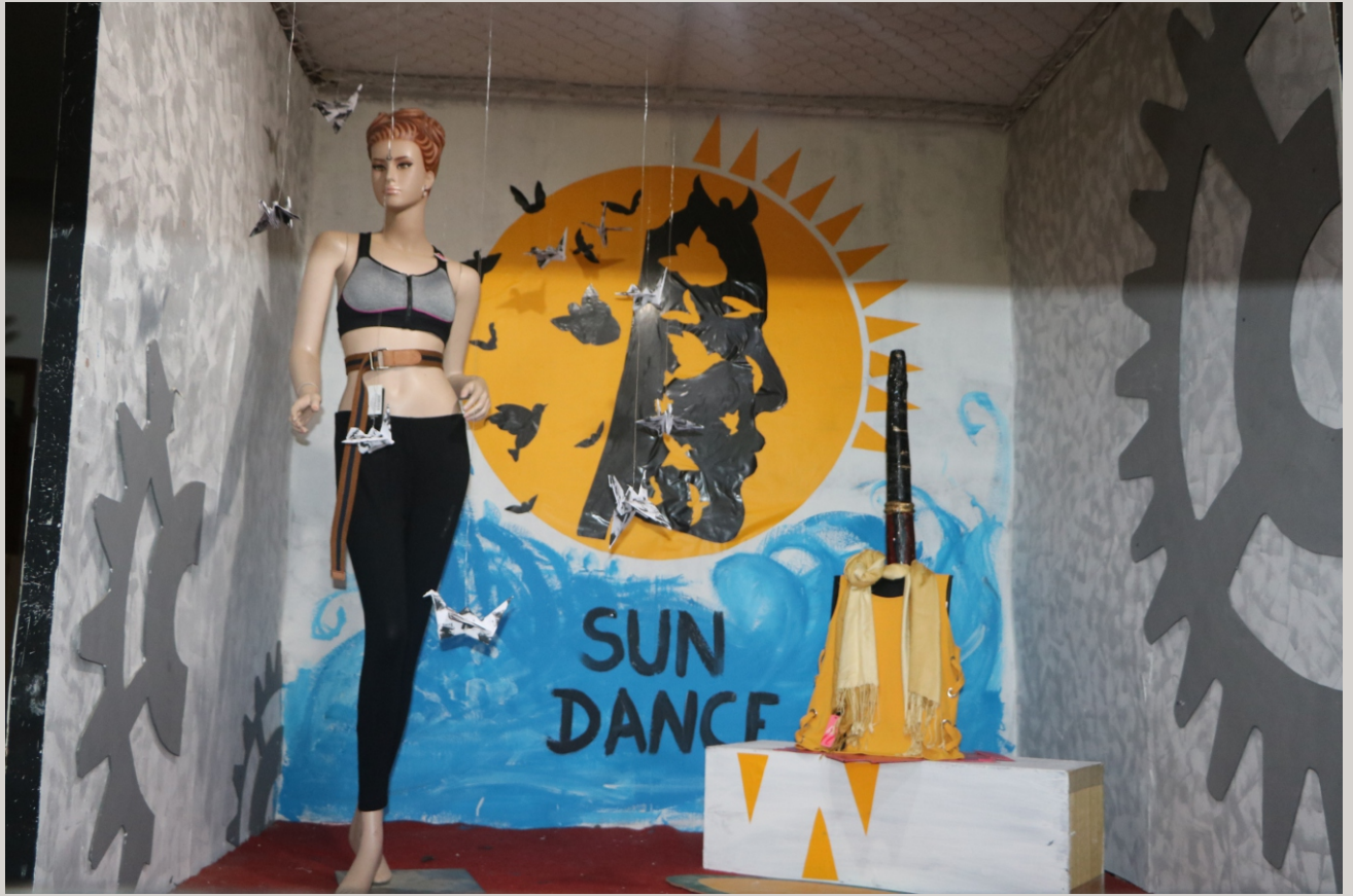
Visual Merchandising Window