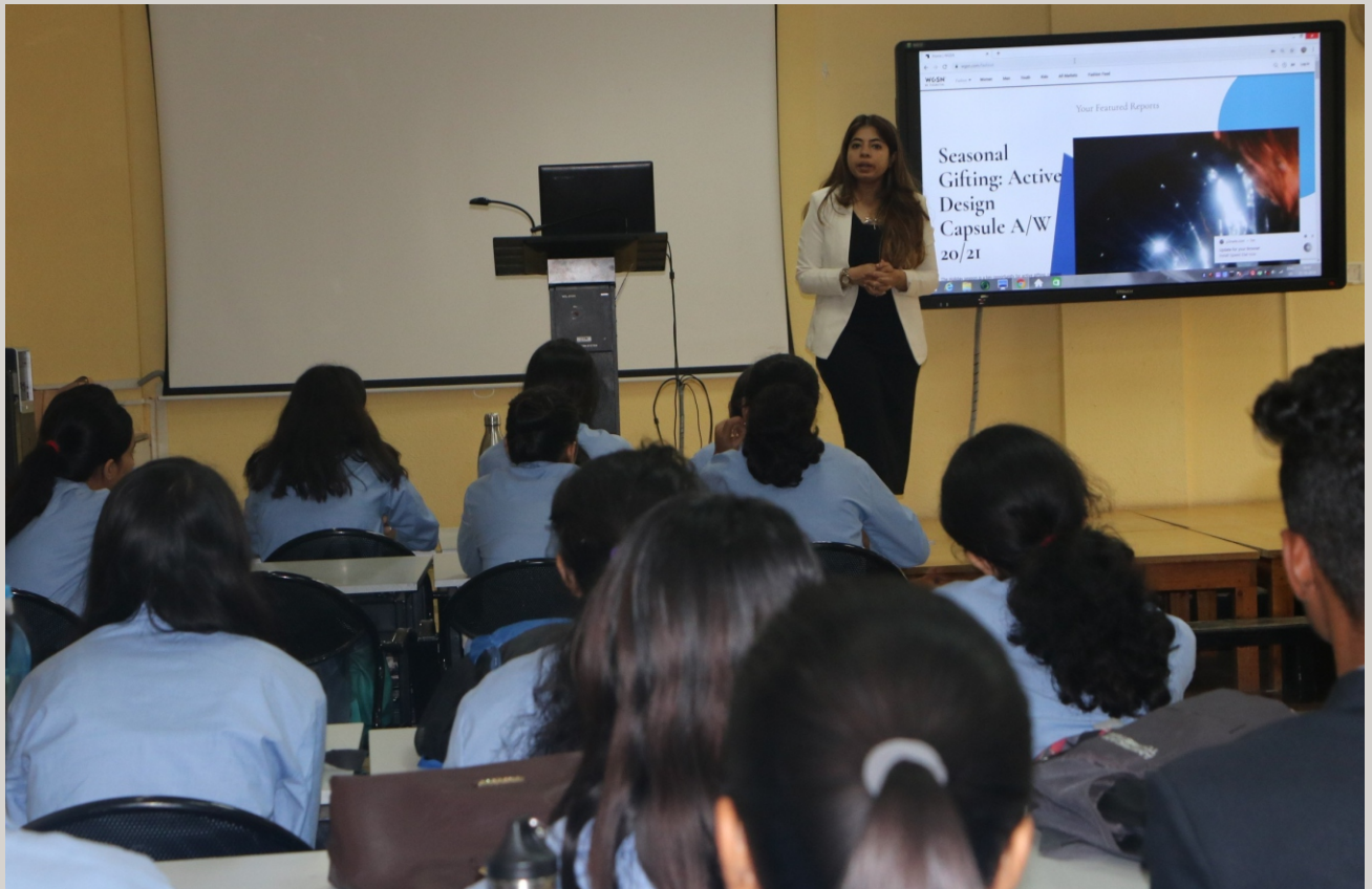
Trend Forecasting Workshop in Progress

So come discover an atmosphere of academic excellence focused on both academic and professional goals. The students have consistently performed at the University level, bagging an average of 40% of the ranks declared each year. (The same course is offered by 27 institutes in Bangalore. The university declares a total of 10 ranks each year. This year AIFD secured 6 ranks out of 10 awarded)